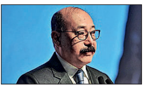
"We have achieved substantial success," Chief Coordinator G20 India, Harsh V Shringla said

New Delhi: Despite global disparities, the Indian presidency of G20 has been able to achieve "substantial success" in prioritising development, especially in the Global South, G20 chief coordinator Harsh Shringla said on Sunday.