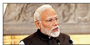
"Such a question would be valid if we had refrained from conducting meetings in those venues," said PM Modi

New Delhi: Prime Minister Narendra Modi on Sunday dismissed China's reservations over holding G20 meetings in Jammu & Kashmir and Arunachal Pradesh, and said it was only natural for India to have the discussions across the country.