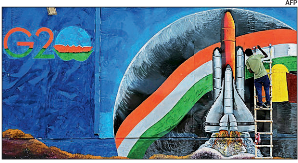
A wall mural ahead of the G20 India summit in New Delhi on Sunday

The sherpas, envoys of their respective leaders, will also seek to forge consensus on the most contentious issues — references to the Russia-Ukraine war, as well as what approach to take on cli-