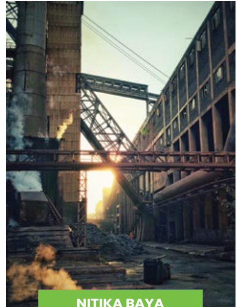
NITIKA BAYA DEPARTMENT - PROJECT