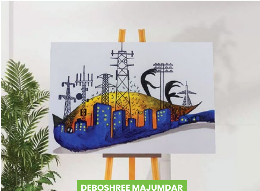
DEBOSHREE MAJUMDAR DEPARTMENT - HR