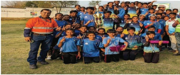
उज्जवल दुनिया संवाददाता

बोकारो : यहां के चंदनकियारी के सियालजोड़ी स्थित वेदांता ईएसएल तीरंदाजी अकादमी द्वारा इंटर-एकेडमी वेदांता चैलेंज ट्रॉफी का आयोजन किया गया। डे बोर्डिंग चंदनकियारी, सेल अकादमी बोकारो, कस्तूरवा