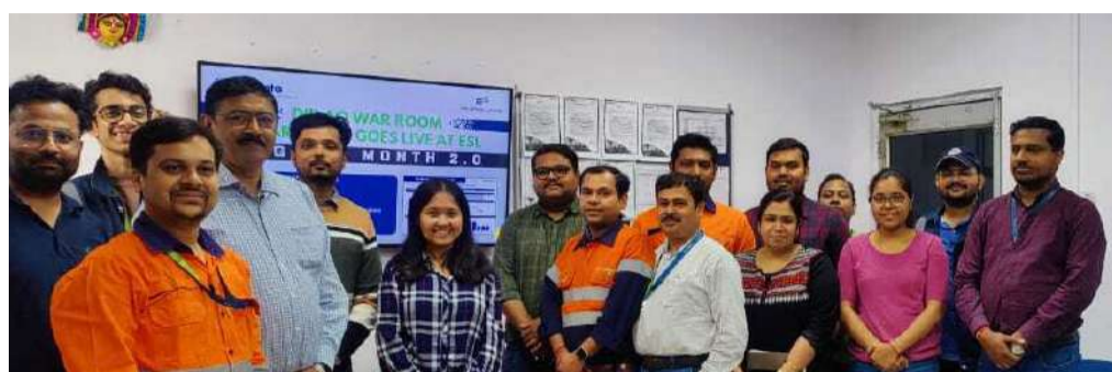
DIGITAL TEAM INTRODUCES DIP AO WAR ROOM SMARTSHEET FOR ENHANCED COMPLIANCE TRACKING & ANALYTICS