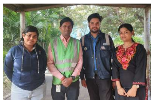
V-GUIDE (MENTOR-MENTEE CONNECT)