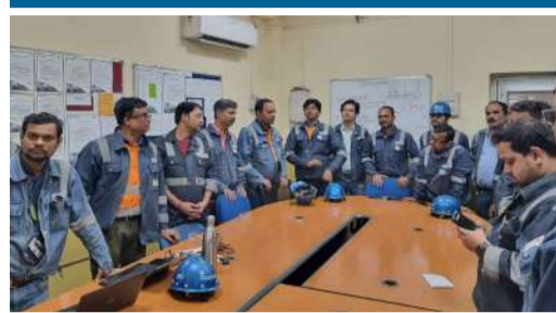
DIGITAL TEAM LAUNCHES AI SLEEP & FATIGUE DETECTION SYSTEM FOR ENHANCED SAFETY