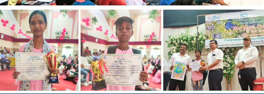
ESL Celebrated World Environment Day with an Engaging Offline Quiz and Fostering Team Spirit!